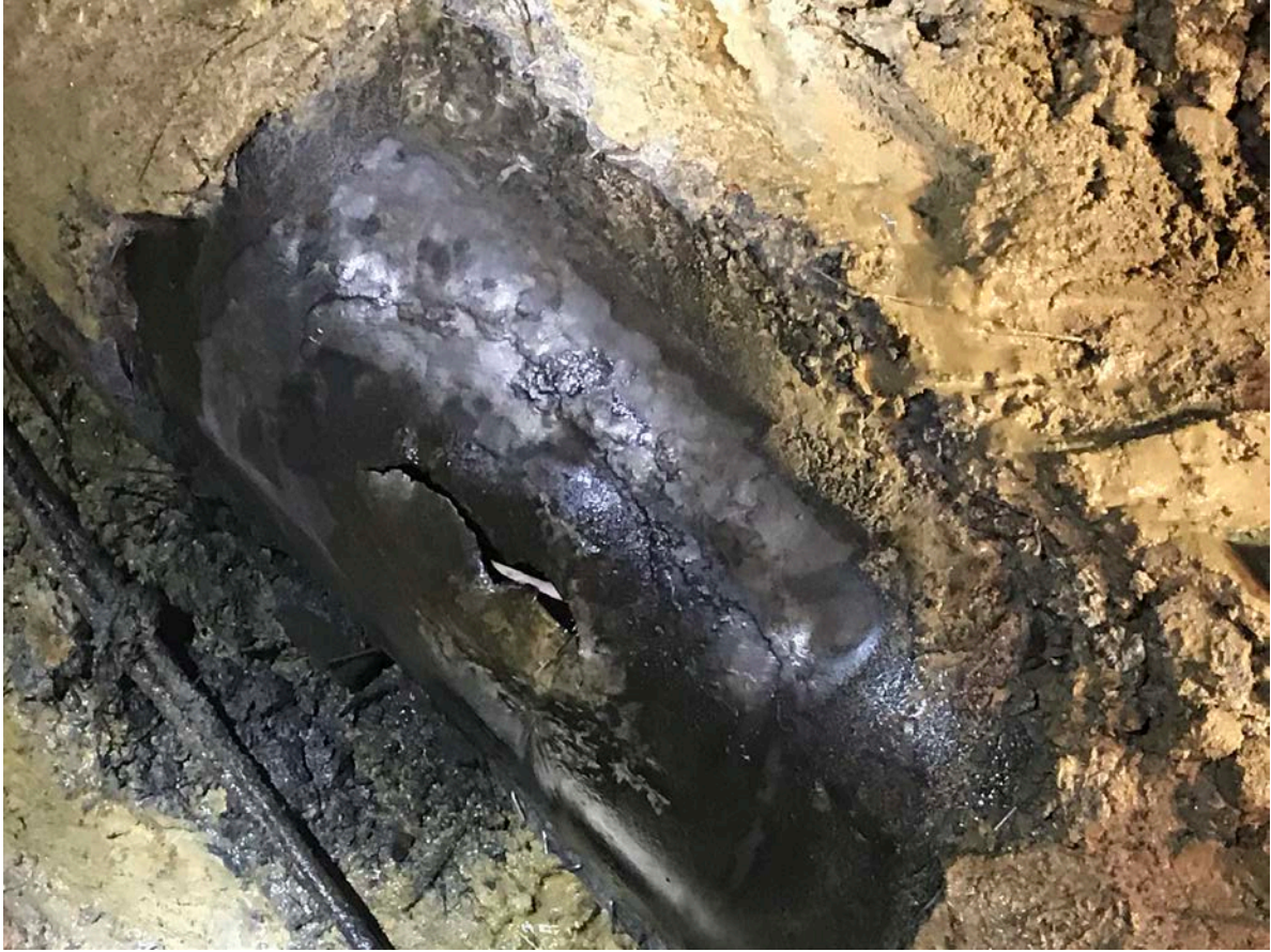
Break in Steel Cylinder