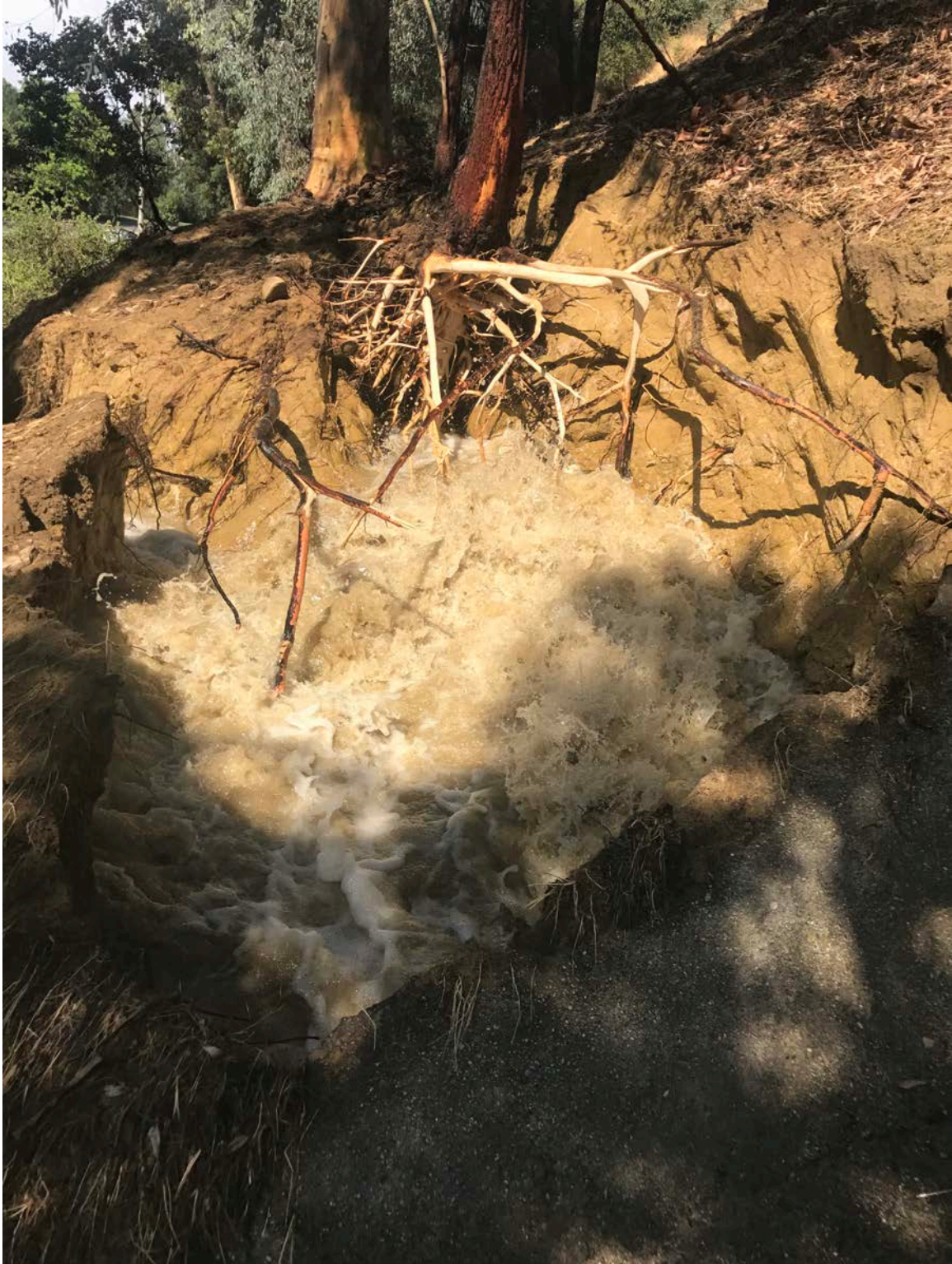
Erosion Undermining Tree