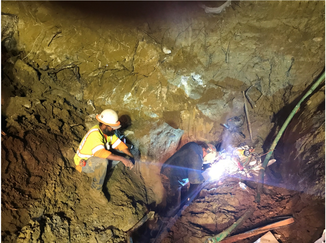
Welding Patch for Temporary Repair