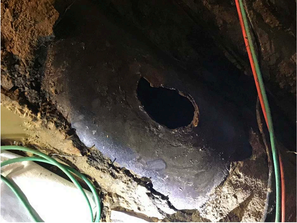
Hole in Steel Cylinder