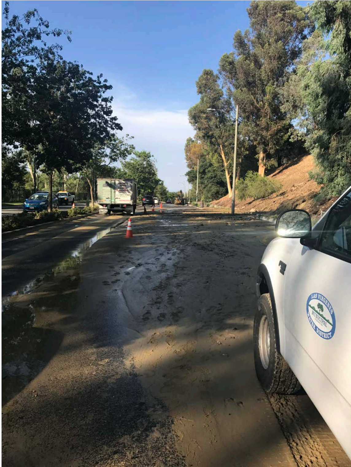
Mud and Debris along Parkway Calabasas