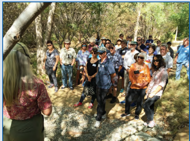
While on the wastewater / watershed tour, participants learn about creek restoration