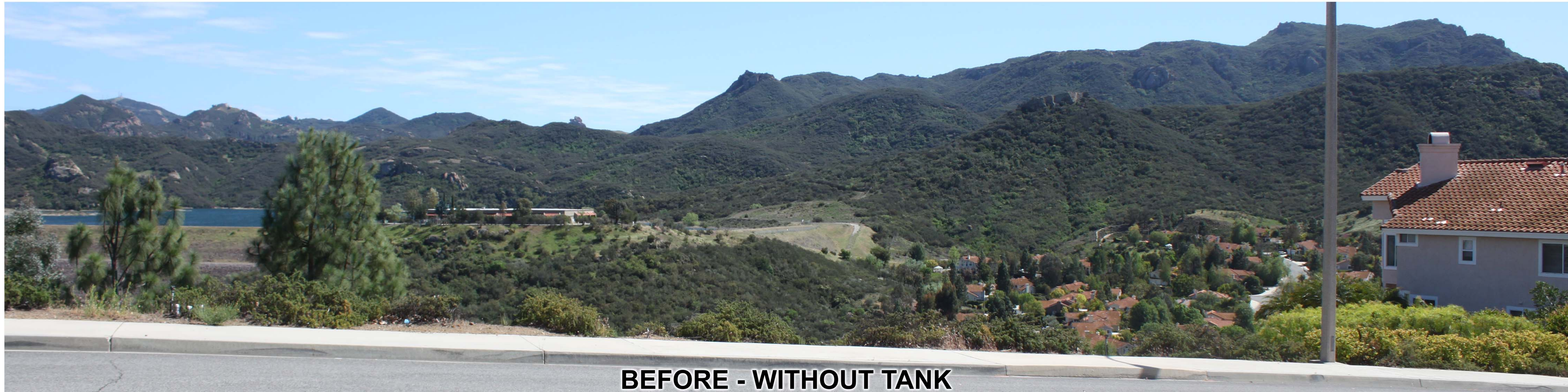
BEFORE - WITHOUT TANK