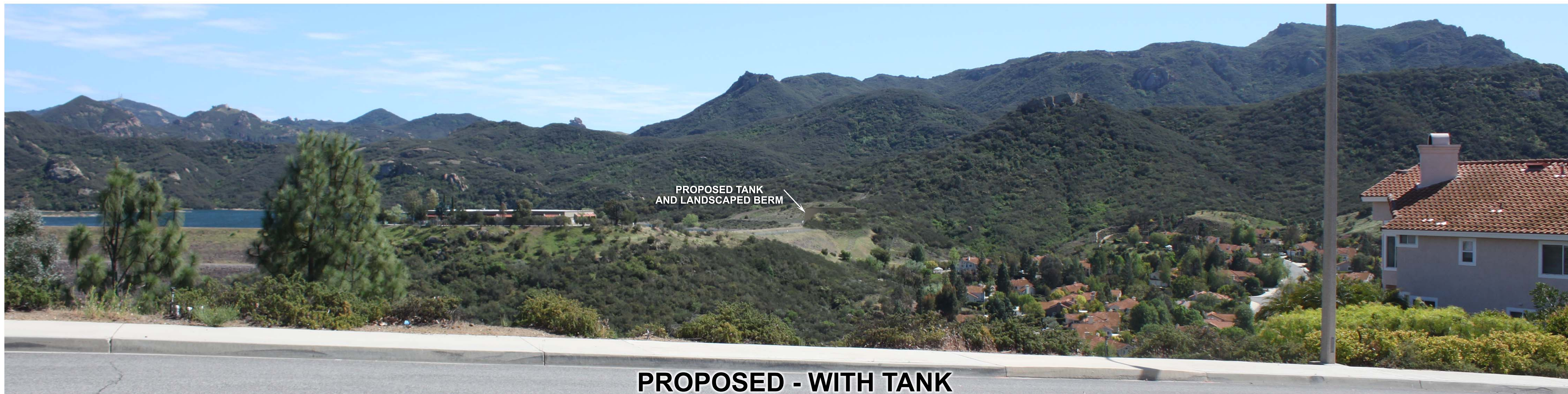
PROPOSED - WITH TANK