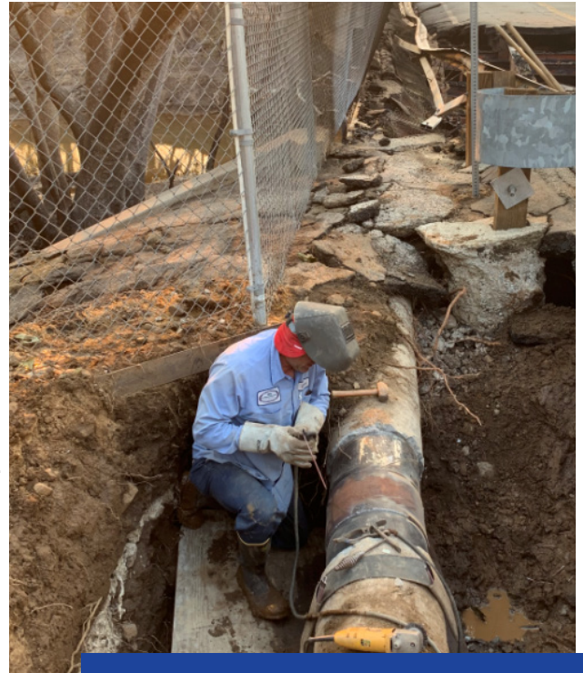
LVMWD Staff performing emergency repairs during the 2018 Woolsey Fire.

District customers can rest assured knowing there will not be a significant nuisance coming from this project. Our contractors will minimize impact by staging all equipment and materials on state park property, and the flow of traffic will continue across the temporary bridge. Additionally, installation of the water main will take place during the construction of the new bridge, so as to not extend the length of time the area is under construction.