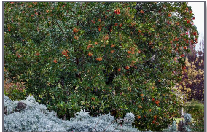
California Coffeeberry Frangula (Rhamnus) californica 'Leatherleaf'

Frangula californica (coffeeberry) evergreen shrub, 6-10 feet tall and wide, with leathery, dark green leaves, pale green beneath, insignificant and greenish yellow flowers in late spring to early summer followed by showy, red fruits that age to black. Native to dry, sandy or rocky slopes from southwestern Oregon to northern Baja California and east to western New Mexico. Sun to shade, most well-drained soils. May be offered as Rhamnus .