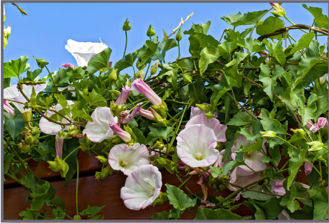
Anacapa Pink Morning Glory Calystegia macrostegia 'Anacapa Pink'

Calystegia macrostegia 'Anacapa Pink' (Anacapa pink morning glory), evergreen vine, fast growing to 15-30 feet, with large, triangular, dark green leaves and white to pale pink, trumpet-shaped flowers from late spring through summer. Climbs by twining. Native to dry, rocky soils on the Channel Islands and mainland California from coastal Monterey County south to Baja California. Cut back annually in winter to control spread. Best along the coast. Cool sun, good drainage. May drop leaves in summer if grown dry.