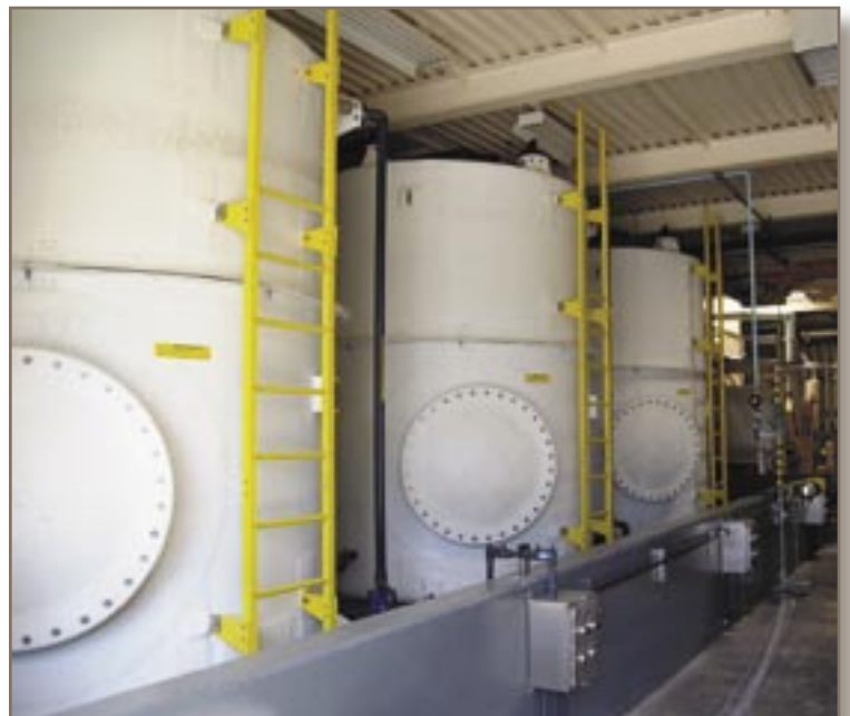
Newly installed upgrades to water disinfection process at Westlake Filtration Plant.

Over the past 50 years, there have been many improvements in the system that brings water to you – we want you to be aware those improvement processes are ongoing with the goal of dependable service at the top of the list.