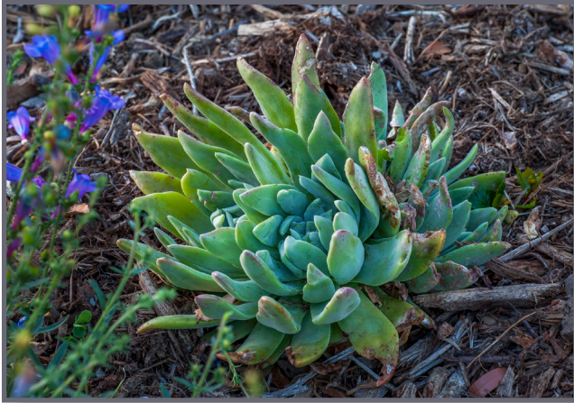
Greene's Liveforever Dudleya greenei

Dudleya greenei , (Greene's Liveforever), succulent, rosette, 6 inches wide, of fleshy, pale green to chalky gray-white leaves with pointed tips and clusters of small, cup-shaped, yellow flowers on tall, branched stems in spring. Offsets to form a small colony or mounding 1 foot tall and wide. Native to gravelly soils on coastal bluffs on the northern Channel Islands. Needs a dry summer dormancy. Cool sun or light shade, afternoon shade inland, fast drainage. Best along the coast.