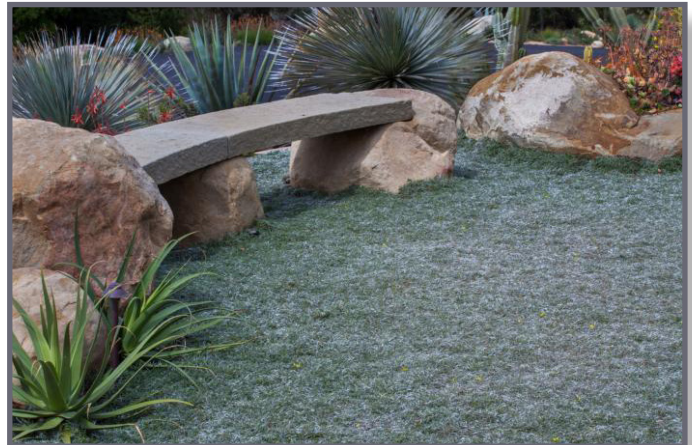
Coast Sun Flower Encelia californica 'Paleo Yellow'

Encelia californica 'Paleo Yellow' (Coast Sun Flower), perennial or subshrub, 3-4 feet tall and 4-5 feet wide, with medium green, oval leaves with serrated margins and pale yellow daisy flowers with dark brown centers in late winter and spring, often reblooming in fall. Species is native to coastal foothills from Santa Barbara to northwestern Baja California. 'Paleo Yellow' is a selection from a planting at the Natural History Museum of Los Angeles County. Sun to light shade, part shade inland, most well-drained soils. Self-sows. Drops leaves in late summer if grown dry. Good seaside plant. Cut back in early winter to renew.