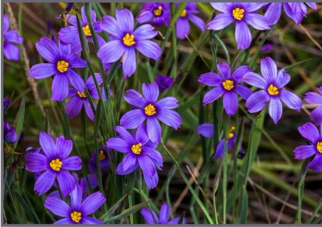
Blue-Eyed Grass Sisyrinchium bellum

Sisyrinchium bellum (Blue-Eyed Grass), perennial, 6-12 inches tall and less than 1 foot wide, with a fan of narrow, upright, green leaves and purplish blue or rarely white flowers with yellow centers in spring. Summer dormant. Self-sows. Native to seasonally moist grasslands and open woodlands, inland and near the coast, from Oregon to northwestern Baja California. Sun to part shade, most well-drained soils.