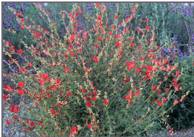
Desert Globe Mallow Sphaeralcea ambigua

Sphaeralcea ambigua (Desert Globe Mallow), perennial or sub-shrub, 2-4 feet tall and wide, with softly hairy, lobed, triangular, gray-green leaves and clusters of bowl-shaped, bright orange flowers in spring or at any time in response to rainfall. Subspecies rosacea has lavender, pink, or white flowers. Native to dry, rocky slopes and washes in deserts from southern Nevada and Utah to southern California, Arizona, and northern Mexico. Sun, fast-draining soils, good air circulation. Cut back in late winter or early spring to renew. Best in hot-summer climates.