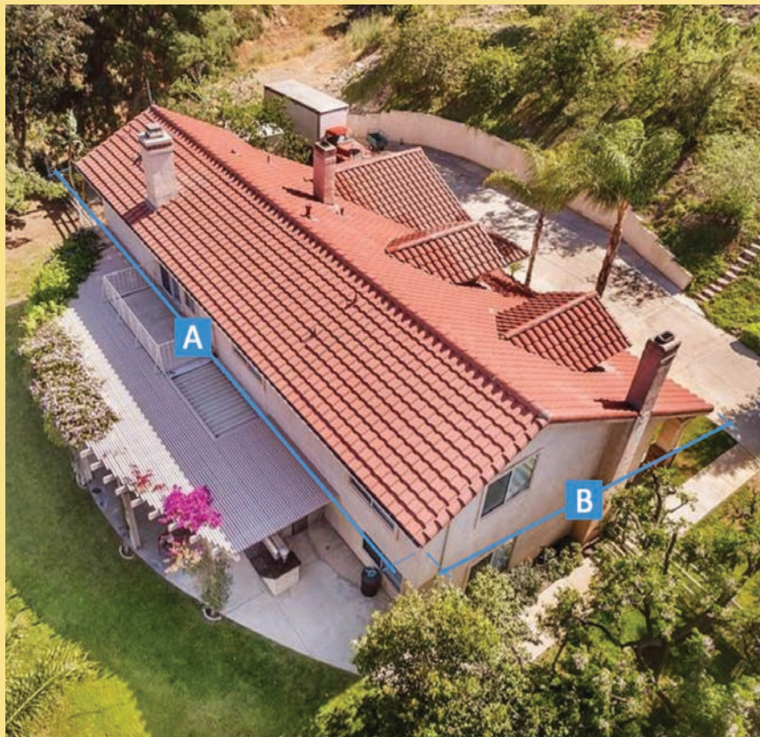
Tom Rau, Mar Vista

You can use these calculations to determine how much water comes off any hard surface (patio, driveway, sidewalk, etc.).