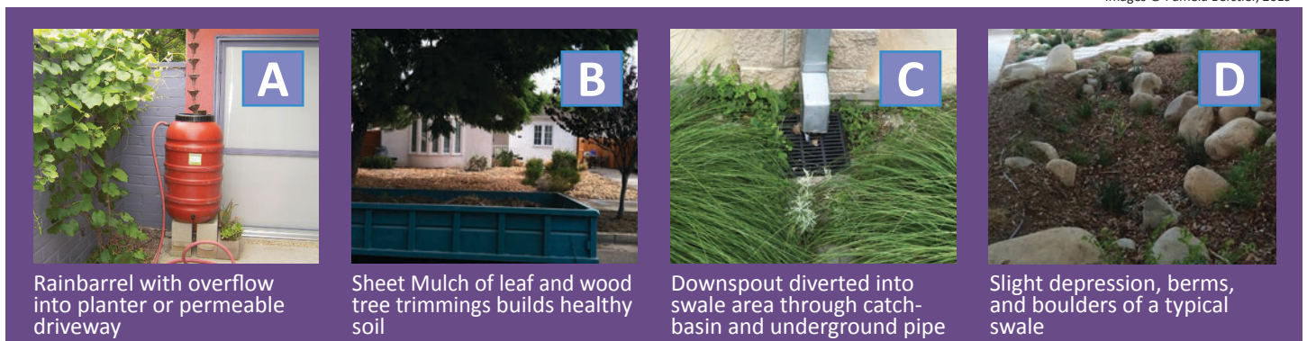
Rainbarrel with overflow into planter or permeable driveway